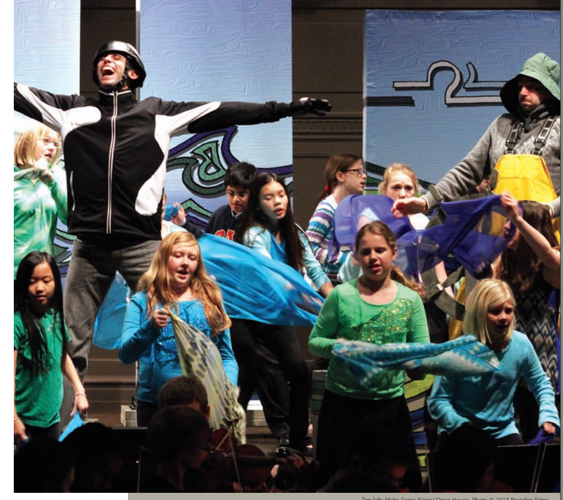
Top left: Make Some Noise! Open House. Photo © 2013 Brandon Patoc. Above: Heron and the Salmon Girl, Photo © 2013 Alan Alabastro.